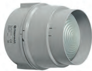
LED Permanent Beacon