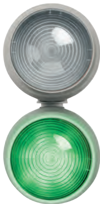
Clear lenses ensure signalling effect even in direct sunlight