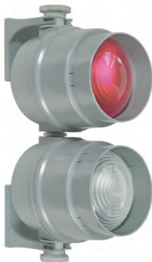
LED Traffic Light Combination with mounting bracket (accessory)